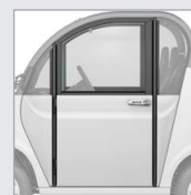
FULL HARD DOOR