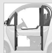
QUARTER HARD DOOR