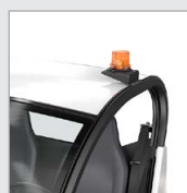
SECURITY LIGHT BEACON