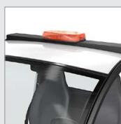
SECURITY LIGHT BAR