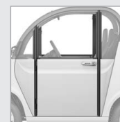
HALF HARD DOOR